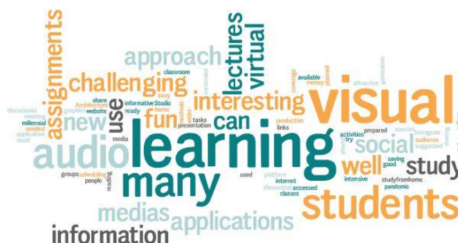
Figure 3. Frequency of word usage

Through the Word Cloud application, the frequency of words used in the respondents' additional comments can be generated as shown in Figure 3. Based on the Word Cloud, the terms most frequently mentioned by the students were learning, audio-visual media, information sharing, new approach, fun, challenging, and interesting. In general, the frequency of these words reflects positive feedback from millennial students about their experiences using social media as platforms for architectural learning.